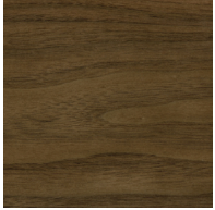
Ash White Oil Waxed - ASH